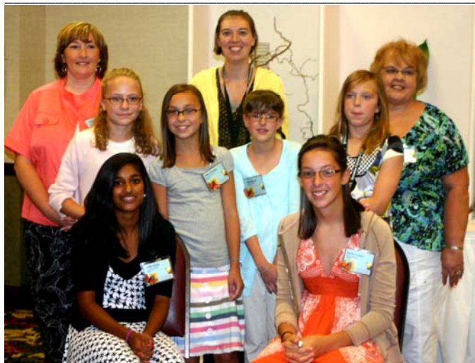
Butterflies Junior Garden Club, Region 3, received the OAGC Membership Incentive Award.