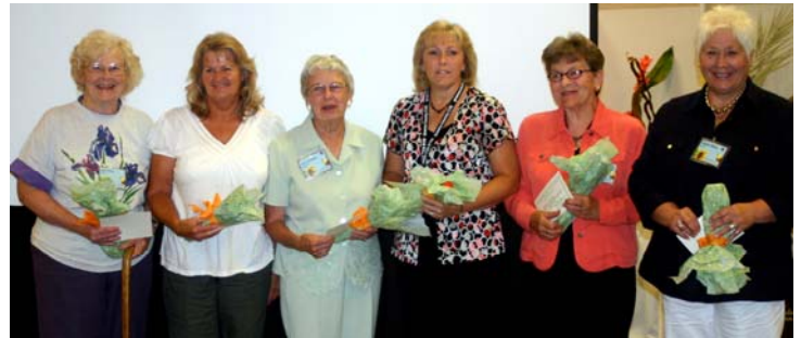
Regional Outstanding Amateur Gardeners

Each winner received a soil knife and a certificate.