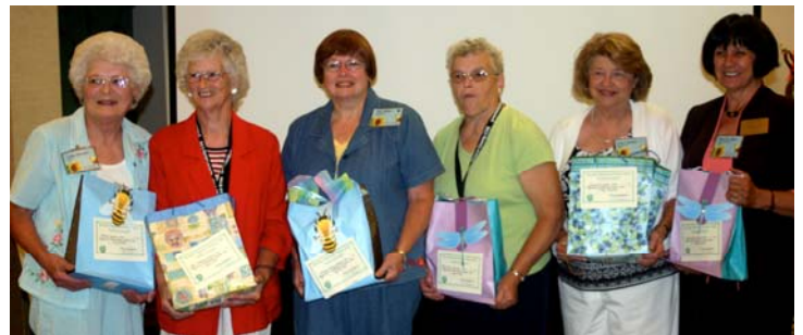
Representatives from the Regional Outstanding Garden Clubs

Each club received the book Wreaths , copies of Ohio Floral Artistry for each member and a certificate.