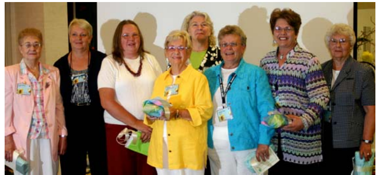
Regional Outstanding Garden Club Members

Each winner received a tote bag and a certificate.