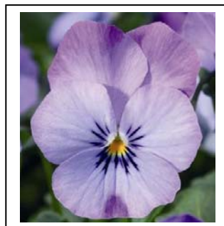
Viola 'Endurio Sky Blue Martien'

Viola 'Endurio Sky Blue Martien' was selected for its unique spreading mounds and for its vigorous garden performance. Fall plantings will continue to bloom well past frost and will come back again for an early show of color in spring. It can also be planted in early spring and will provide a bounty of sky-blue blooms well into summer. It is perfect for edging garden beds, boxes and hanging baskets.