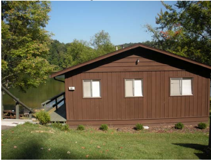
One of the cabins at Salt Fork State Park

OAGC is seeking 2010 Landscaping Design Stars! Reserve the weekend of May 21, 22, and 23 for a great get away weekend to Salt Fork State Park in the Cambridge area. In cooperation with Salt Fork State Park, garden club members are challenged to compete in landscaping a lakeside cabin. Your design team will reside in your charming cabin for the fun weekend. Salt Fork is giving us great cabin rates: $99/night for