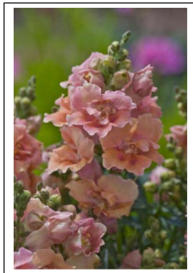
Snapdragon 'Twinny Peach'

Snapdragon 'Twinny Peach' is a unique, double-flowered snapdragon in a blend of peach tones - soft shades of peach, yellow and light orange. In full sun, the plant produces abundant spikes which are excellent for cut flowers. The compact plants (to 12 inches) continued to flower all season with good heat tolerance in the AAS Trials.