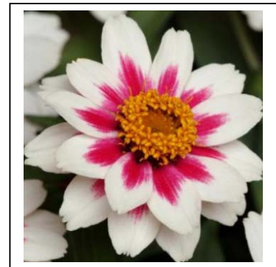
Zinnia 'Zahara Starlight Rose'

Zinnia 'Zahara Starlight Rose' offers a new bicolor rose and white, two and one half inch blossom with good resistance to heat, drought, leaf spot and powdery mildew. The mature plants, covered with blooms all season, reach about 12-14 inches tall and wide.