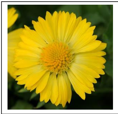
Gaillardia 'Mesa Yellow'

Gaillardia 'Mesa Yellow' is the first hybrid blanket flower bred for compact growth. It forms a mound reaching up to two feet in full sun. The prolific, early, three inch daisy-like flowers are excellent for cutting but will attract butterflies if left on the plants. Plants are perfect for containers and limited-space gardens.